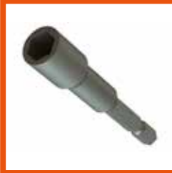
8mm Hex Socket Driver