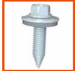
Self Drilling Screw

Use the layout to confirm the position of the Trapezoidal Console LP.